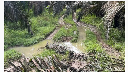
The picture of the access roads to the oil palm plantation showing failures due to soft ground

Road, Pavement, & Trafficked Areas | No. 508